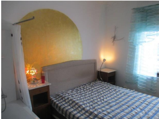
Aðalstræti 22 – second floor - Room B – Studio B