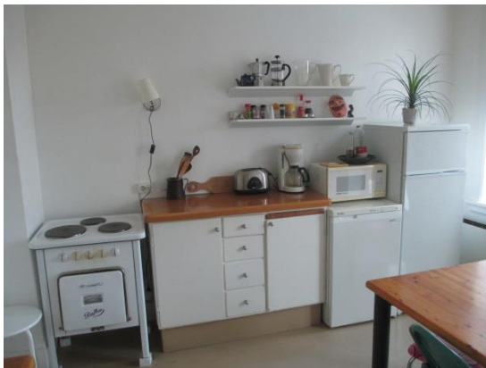
Aðalstræti 22 – second floor - Shared kitchen for A and B