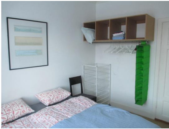
Aðalstræti 22 – second floor - Room A – Studio A