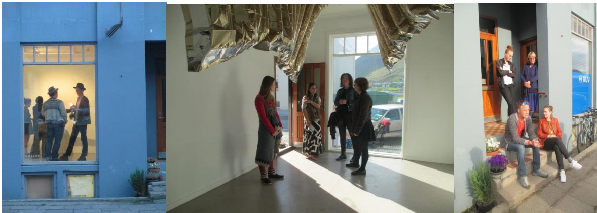
Aðalstræti 22 – ground floor - Outvert Art Space

Outvert Art Space is a non-profit organization and a dynamic, contemporary cultural arts space where varied perspectives and issues are explored through visual arts, music, performance and other forms of media. Outvert Art Space collaborates closely with ArtsIceland programs. ArtsIceland and Outvert Art Space are particularly interested in helping artists and curators achieve projects that have significant cultural impact but would be impossible to realize in a traditional gallery or museum setting.